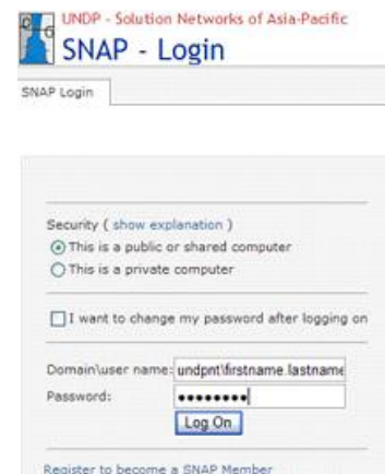
Figure 1: Enter UNDPNT\firstname.lastname as your username and the password which has been provided to you.

Username : UNDPNT\firstname.lastname Password : as provided to you.