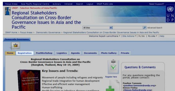
Figure 2: Regional Stakeholders Consultation on Cross-Border Governance Issues in Asia and the Pacific Homepage